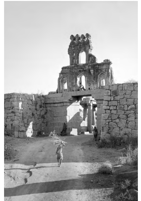
Bhima's Gate, Hampi