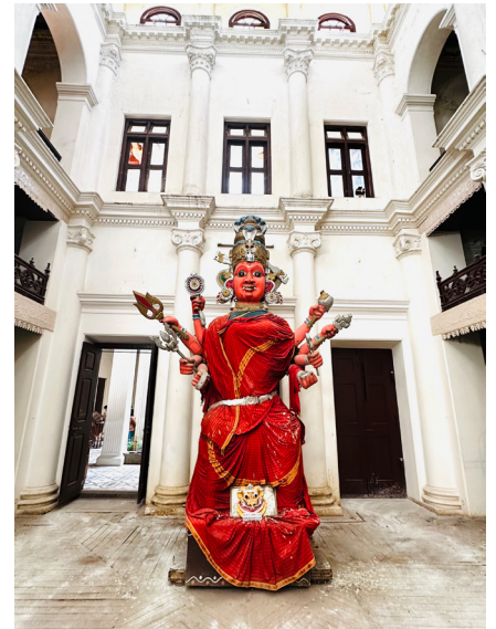
Jayalakshmi Vilas Mansion, Mysuru, Karnataka

A core objective of DHF's restoration and community projects is to develop a sustainable model of heritage management by institutionalising historic building maintenance and management, building an in-house capacity and engaging the local community. Following the rehabilitation and revitalisation of an ancient hydraulic system in Bidar, Karnataka, DHF launched a solid waste management program involving the community in the area. DHF also takes on numerous initiatives to promote the art and culture of the Deccan through its webinars and lectures, and facilitates travel to the Deccan region with its informative books and guidebooks.